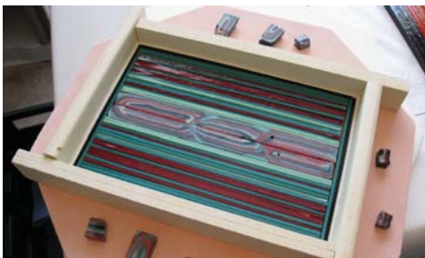
Pattern bar slices and strips of cut glass arranged into a design and ready for firing.