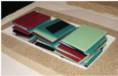
Cut glass ready to be fired.

Each piece created by Grand Mesa Studios is designed, formed, fired and finished by Lydia in a multi-step process using various techniques, including “pattern bars” and “on edge construction.” To create the plate featured below, pieces of compatible glass are cut and fired to form a slab approximately 19mm thick. This slab is then sliced into strips to form pattern bars. The pattern bars are then arranged into a design, along with strips of cut glass, and fired again to fuse the pieces together. The fused piece is then “cold-worked” to create smooth edges and either a shiny or matte finish. This is accomplished using machines such as an angle grinder, wet belt sander and sand blaster. Finally it is fired, or “slumped,” using a mold to form a plate. Each firing takes approximately 13 hours and the entire process from start to finish takes 3 - 4 days to complete.