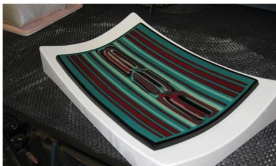
Sandblasted and slumped in a plate mold.