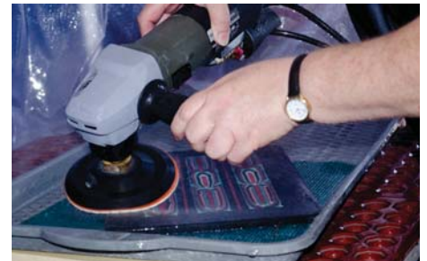
Cold-working using an angle grinder to get a smooth finish.