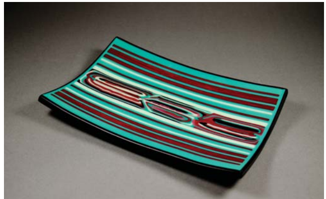
The final piece.