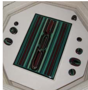
The piece after it has been Full fused to 1490°.