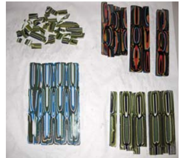
Sliced pattern bar pieces.